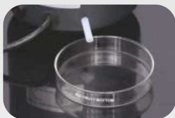
Liquid Spill Protection