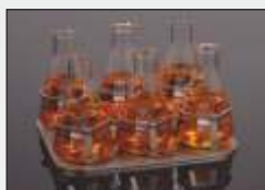
Platform with clamps, 6 Places (250ml)