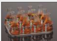
Platform with clamps, 12 Places (100ml)