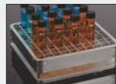
Platform universal for tubes