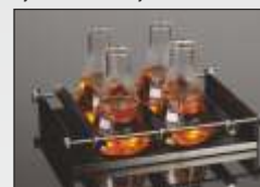
Platform, Universal, with 3 secured bars