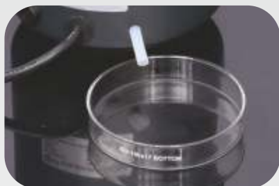
Liquid Spill Protection